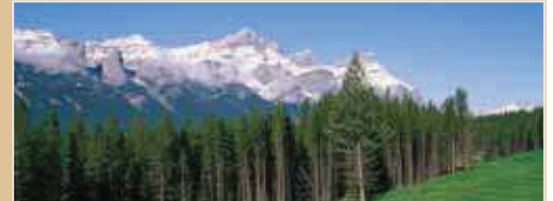
PERMAX IS A SAFE, NON-TOXIC PRODUCT WITH NO OFF-GASSING, NO FORMALDEHYDE AND NO OZONE DEPLETION.

Noise pollution — sirens, cars, motorcycles, planes, barking dogs, construction — can affect sleep and increase stress. Everyone needs peace and quiet. PERMAX helps deaden the sounds of the outside world; creating a tranquil environment.